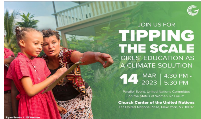
Tipping the Scale features three Future Rising Fellows who will each share their experiences with climate crises